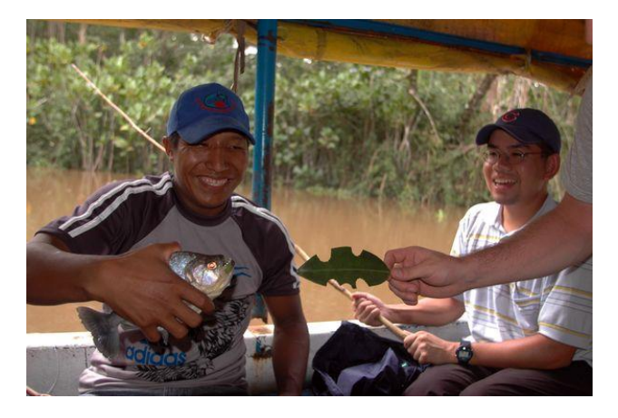
Warao guide - Piranha fishing

Navigate the Orinoco in search of river dolphins, spectacled caiman, capuchin and red howler monkeys by the river's edge, hummingbirds, scarlet ibis, toucans, parrots, macaws and kingfishers in the skies and trees above. Try your hand at piranha fishing. Visit Warao villages and their palafitos that line the riverbanks. Your guide will explain about Warao culture, and the flow of the community's daily life. Meet some of the Warao craftsmen / women and negotiate for their handcrafts. Typical lodge (B, L, D)