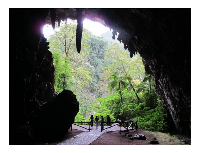
Entrance to La Cueva Del Guácharo

Visit the beautiful town of Caripe and the famous cave of del Guácharo with its Oil Birds and miles of tunnels. Local posada. (B,D)