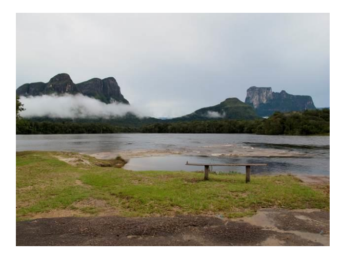
View from the Piaroa community. Autana (far right)

Arrival in Puerto Ayacucho, airport assistance and transfer to a local hotel for the night. Time permitting visit the town centre with its plaza full of indigenous people selling their handicrafts and art followed by a visit to the local indigenous museum and visit Plaza Bolivar and the local cathedral with its impressive hand painted walls and ceilings (some painted by the local governor of the state – an artist in his own rights). Local hotel (no meals)