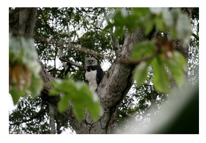
Young Harpy Eagle observing the observers!

Rising at dawn and taking a picnic for breakfast and get driven to one of the Harpy Eagle's nesting sites in the area on the way stopping to spot other bird species. The morning tour lasts about six hours. Local posada. ( B,L,D )