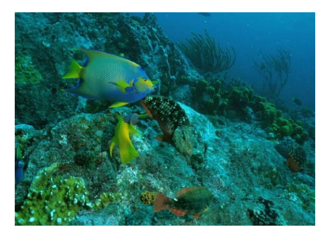
Queen and Spotlight Fish