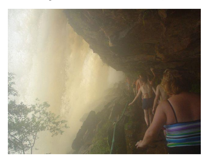
The wrath of Sapo Falls in rainy season, Canaima

Fly to the jungles of Canaima, dotted by lagoons and soaring waterfalls pouring over the sheer cliffs of flattop tepuis . You are transferred to your lodge for a day of exploring, including a curiara ride across the lagoon and a hike to Sapo Falls walking behind its curtain of water (see below). Rustic (budget) – standard - superior accommodations available (L,D)