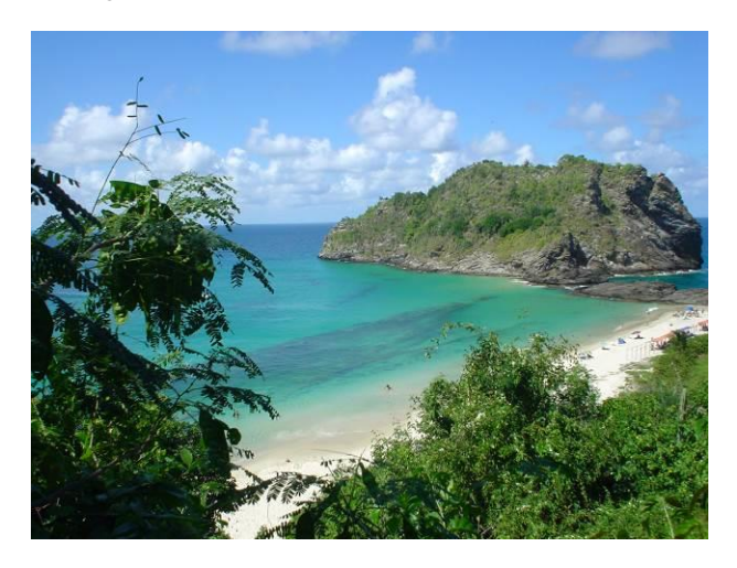
Deserted beach of Catica - even on weekends!

A scenic 3 - 31/2 hr. drive from Caracas with the last 1 1/2 hrs. driving up high into the clouded rainforest of Henri Pittier (Venezuela's first National Park) and down towards the "Pirate" coast. Arrive to where the "rainforest meets the sea" one can enjoy the local beaches of Cata and Catica if you arrive early enough in the day. The secluded beaches are often deserted mid-week, except for the local vendors of fresh fish, local seafood and refreshing Caribbean cocktails. You have the option of continuing on to La Ciénaga or staying on the mainland at De La Costa Ecolodge. De La Costa Ecolodge (L,D)