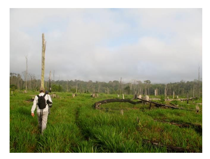
Lush farm land / rain forest – Imataca rainforest