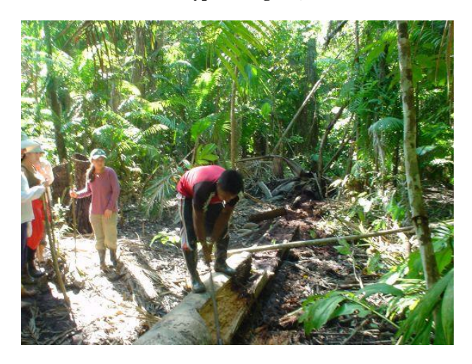
Warao guide searching for "food" in jungle

We start our expedition in Maturín or Puerto Ordaz traveling by road and then by river to the lodge in the Delta. From the comfort of your water-taxi you may observe a wide variety of flora and fauna, such as the Boral (a river plant), pink dolphins, giant river otters, toucans, macaws, parrots, llanos side neck turtles and even occasionally one may see an anaconda. Along the riverbanks you will see the local Warao indigenous peoples villages with their unique raised dwellings (palafitos), built over the river's edge. Experience the wild, natural habitat of the virgin jungle, your Warao guide will point out edible plants which sustain the natives on hunting trips. Enjoy one of the fabulous Delta sunsets. Typical lodge (L, D)