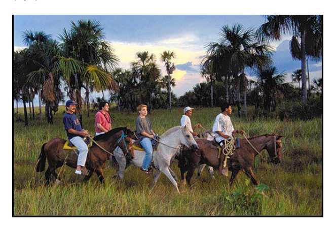
Horseback riding in the Llanos

Fly or drive to Venezuela's premier wildlife region, Los Llanos, where an outstanding diversity of animals is easy to spot in the vast wet lands. Transfer from Barinas to your room at one of the finest hato ranches in the land. Then set out to explore the special beauty of the surrounding wilderness. Hato El Cedral or similar (L,D)