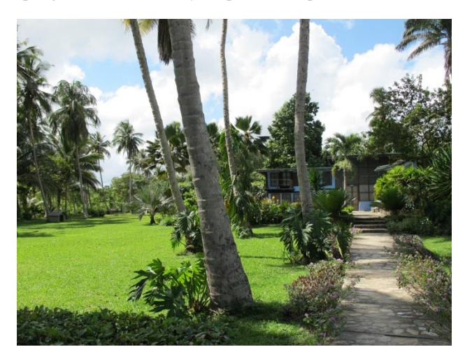
Hacienda Posada Agua Sana

Visit Agua Sana (hot springs) and enjoy the different types of springs available. Relax by the pool. Local posada. (B,D)