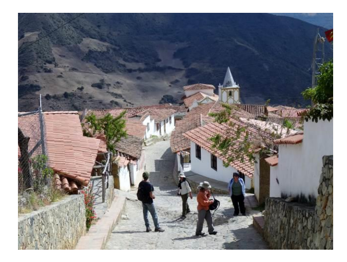
Los Nevados - The Andes

Take a jeep transfer winding high up into the Andean peaks to one of the highest villages in the Andes, Los Nevados. Enjoy amazing vistas of the valleys below. Upon arrival enjoy an afternoon hike or relaxing mule ride to a local trout farm in the mountains or simply enjoy the local trails. Local posada (B,L,D)