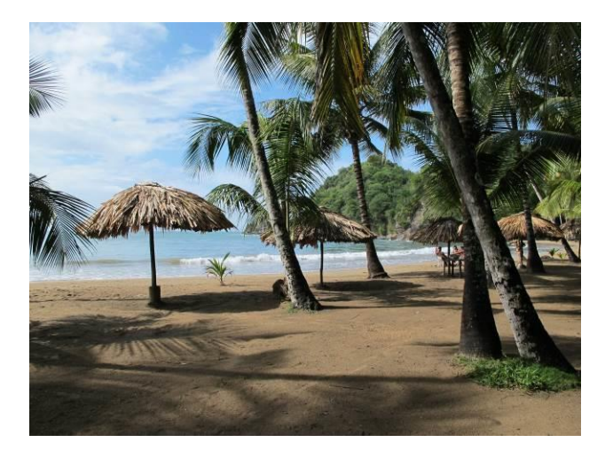
Playa Medina (Paria)