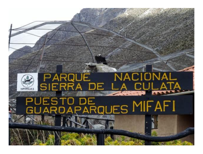
Andean Condor research station - Mifafí Highlands

Descend once again to the city of Mérida and continue on into the Páramos. Time permitting; enjoy a beautiful hike to a thermal spring in the mountains with more beautiful vistas. Visit the Andean Condor research station before a final journey to your hotel / posada for the night in or near Santo Domingo. La Trucha Azul or local posada (B,L)