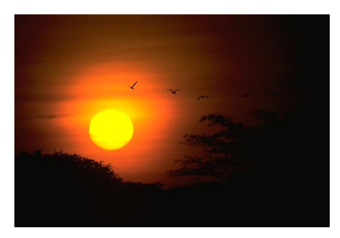
Los Llanos sunset

Transfer from Barinas or Mérida to Los Llanos - an adventure in itself. Passing through the Venezuelan highlands your driver will stop in Andean towns and the beautiful Sierra Nevada National Park. Maybe visit local cocoa and coffee farms located on the foothills of the Andean rainforest or visit a local trout farm. When you arrive at the camp, located near Guaritico wildlife sanctuary, you will be given a candlelight dinner. Overnight in hammocks – listen to the sounds of the Llanos. (B,L,D)