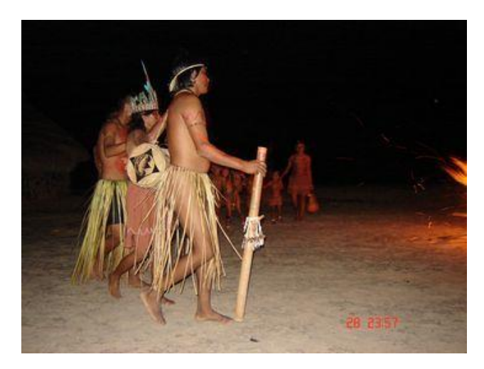
Pemón ritual dance (specially arranged for groups by request)

Morning to relax before your transfer to the airstrip and flight back to Caracas. (B)