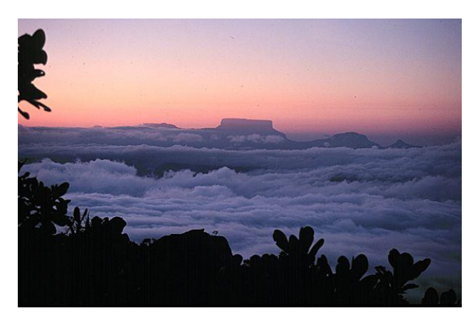
"Islands in time" – National Geographic May 1989

Waking alongside a thick and lush belt of humid cloud forest we trek for about 2 hrs. through this thick and beautiful jungle with many neo tropical plants such as bromeliads, tree ferns and helicons. After another 2 hours of ascent along a path with big rocks we reach the top of the plateau, seems like we landed on the moon! Lunch followed by an exploration of the strange surroundings on this "island in time". ( B , L , D )