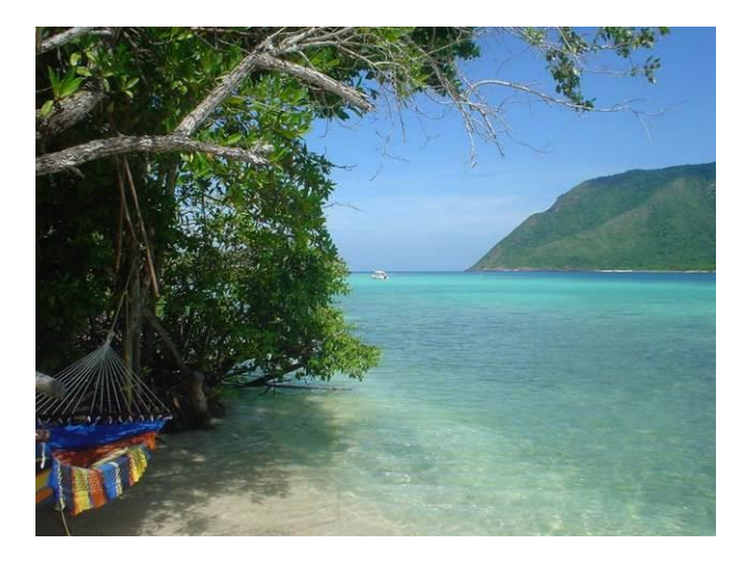
La Ciénaga Lagoon

Visit the spectacular saltwater lagoon of La Ciénaga surrounded on three sides by mountainous rainforest. Swim, snorkel, kayak and explore the mangroves, tiny beaches and explore our nature trails behind the mangroves in the xerophytic rain forest where it is possible to see monkeys, deer, wild pigs and tracks of larger animals. Take the kayak out early morning to search for turtles "dining" in the lagoon on the sea grass and look for the large starfish below the surface. Learn about the importance of mangroves in our ecosystem.