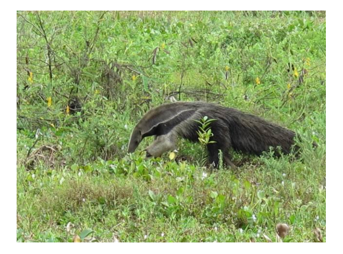
Giant Anteater of the Llanos

After breakfast return up through the Andes to Mérida maybe enjoy a rafting trip or tubing in an Andean foothill river with expert guide and equipment (seasonal). ( B , L )