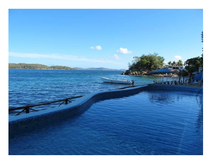
Pool Side at Mochima National Park

Explore the islands of Mochima National Park or simply take a transfer to one of the national park's secluded beaches, sunbathe, swim and enjoy fresh fish on the beach. Local posada. (B,D)