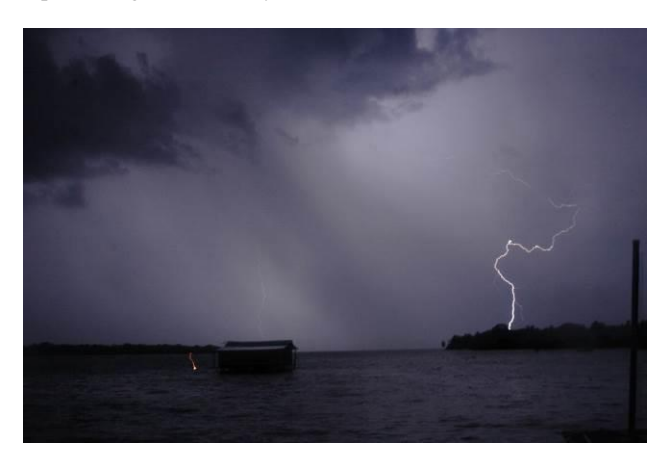
Catatumbo lightning phenomenon

Visit old sugar cane factories on the way to Lagunillas. See how "Chimo" paste is prepared and visit coffee and cocoa plantations in the foothills of the Andes. From the Maracaibo basin, embark on a fishing boat to visit mangroves, swamps, gallery forests and open lake to observe wildlife such as freshwater grey dolphins, iguanas, flocks of colourful birds and red howler monkeys. Overnight out on the lake in a stilted house known as a "Palafito" (hammocks). Keep one eye open all night to experience the phenomena of the Catatumbo lightning, replenishing the ozone layer! (L,D)