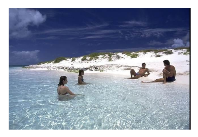
Pristine beaches of Los Roques

Spend the day exploring one of the richest marine habitats in the Caribbean, with snorkeling and the option of diving in various unique settings. Take an optional side trip to the islands of Cayo de Agua and Dos Mosquises and visit the turtle conservation centre. Typical posada (B,L,D)