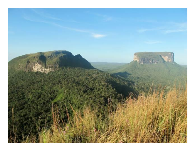
View from atop Kuravaina-Tepui

Take an early morning trip across the lagoon by curiara to either Sapo or Hacha Falls and walk behind their curtain of gushing water before returning back to Caracas. ( B,L )