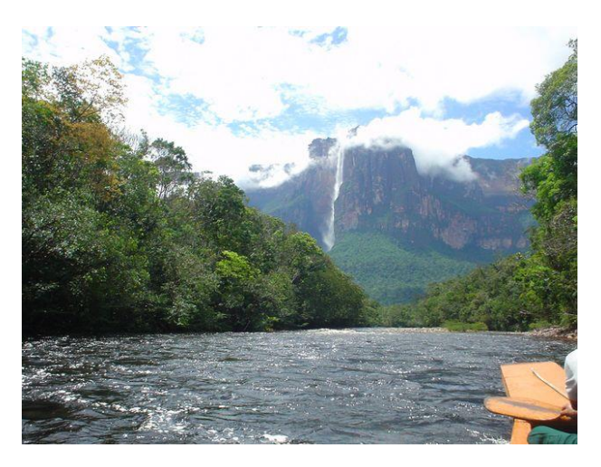
Angel Falls approach (Rio Churún)

Return to Canaima and fly back to Caracas. (B)