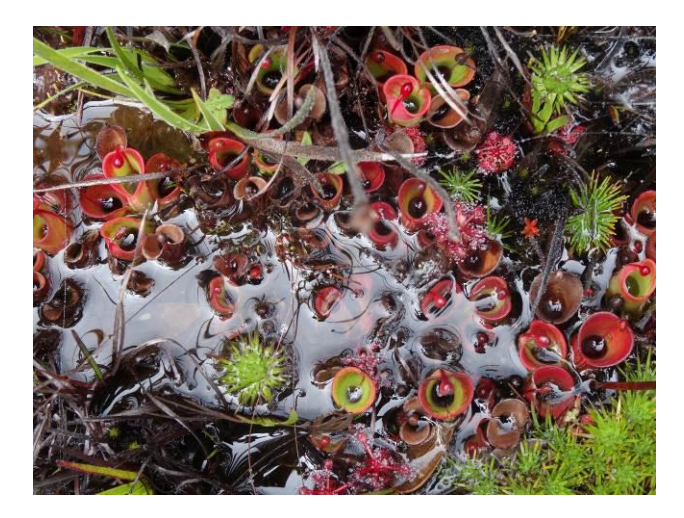
Pitcher plants, sundews etc

Today we will relax before our return down the tepui, taking breakfast around 8:00am, discovering the surroundings around the Churún River. We'll have a picnic beside the river, where we'll relax before returning to camp for the night and dinner. Here we will see many different plant types such as sundews (carnivorous plants), orchids amongst other endemic species. (B,L,D)