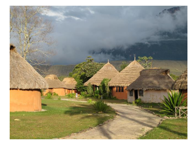
Uruyén Lodge, Canaima National Park

The whole valley (Kamarata Valley) is overlooked by vast table top mountains; it's surrounded by savanna grasslands and outcrops of rainforest and local indigenous communities. Uruyén Lodge (L,D)