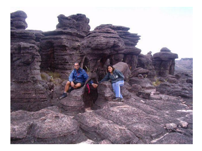
Strange rock formations

Time for some last photographs of the plants and views - we start our descent saying good-bye to the giant flying turtle and all the other strange rock formations! We will trek to Rio Tek (around 6 to 8 hours); mostly strong downhill and a refreshing swim in the cool river will be the supreme reward after the day's long trek. (B,L,D)