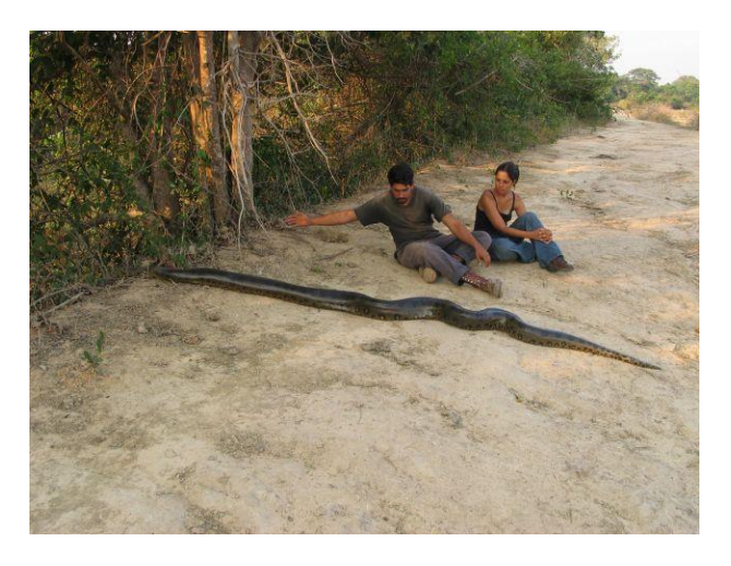
Anaconda up close and personal

Jeep excursions in the dry season and boat outings in the wet months (roughly May to November) offer possible sightings of crocodiles, giant anteaters, iguanas, capybaras, monkeys, tapir, deer, giant river otters, caiman, anacondas, and hundreds of species of exotic tropical birds. At the lodge, enjoy nature presentations, a swim in the pool and an evening of "joropo" folk music of the local "llaneros". Hato El Cedral or similar (B,L,D)